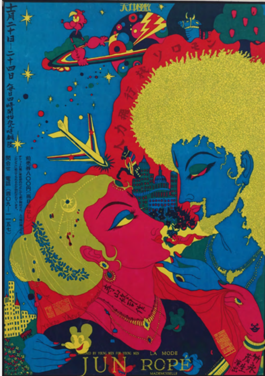
(Left) TADANORI YOKOO, Man-Powered Plane – Solomon, Tenjō Sajiki , 1967