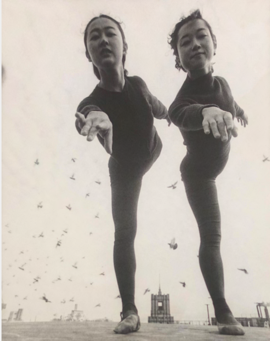
GEN OTSUKA, Ballet dancers, Tokyo, 1954

Michael Hoppen has travelled back and forth to Japan ever since and built up a varied and personal collection of Japanese materials. Okashi includes a collection of 1800s engravings which features depictions of ohaguro – the ancient Japanese practice of teeth blackening, a custom deemed alluring and beautiful which delighted in its strangeness.