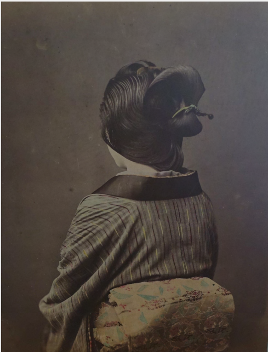
UNKNOWN PHOTOGRAPHER Japanese woman showing back of hair and obi (sash), c. 1885