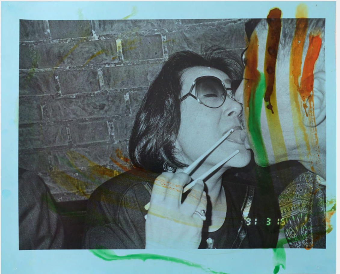
MASAHISA FUKASE Berobero - Untitled, 1991