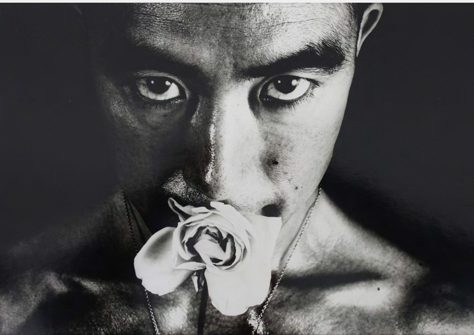
EIKOH HOSOE, Ordeal by Roses #32 , 1961

'My fascination with Japan was first provoked by seeing Japanese photobooks and magazines as a young photographer in the 1970's. When I first visited Japan 20 years ago, I was completely blown away by its energy and diversity. Whilst photography was, and remains, my key passion, I was enthralled and seduced by almost everything I laid eyes on.'