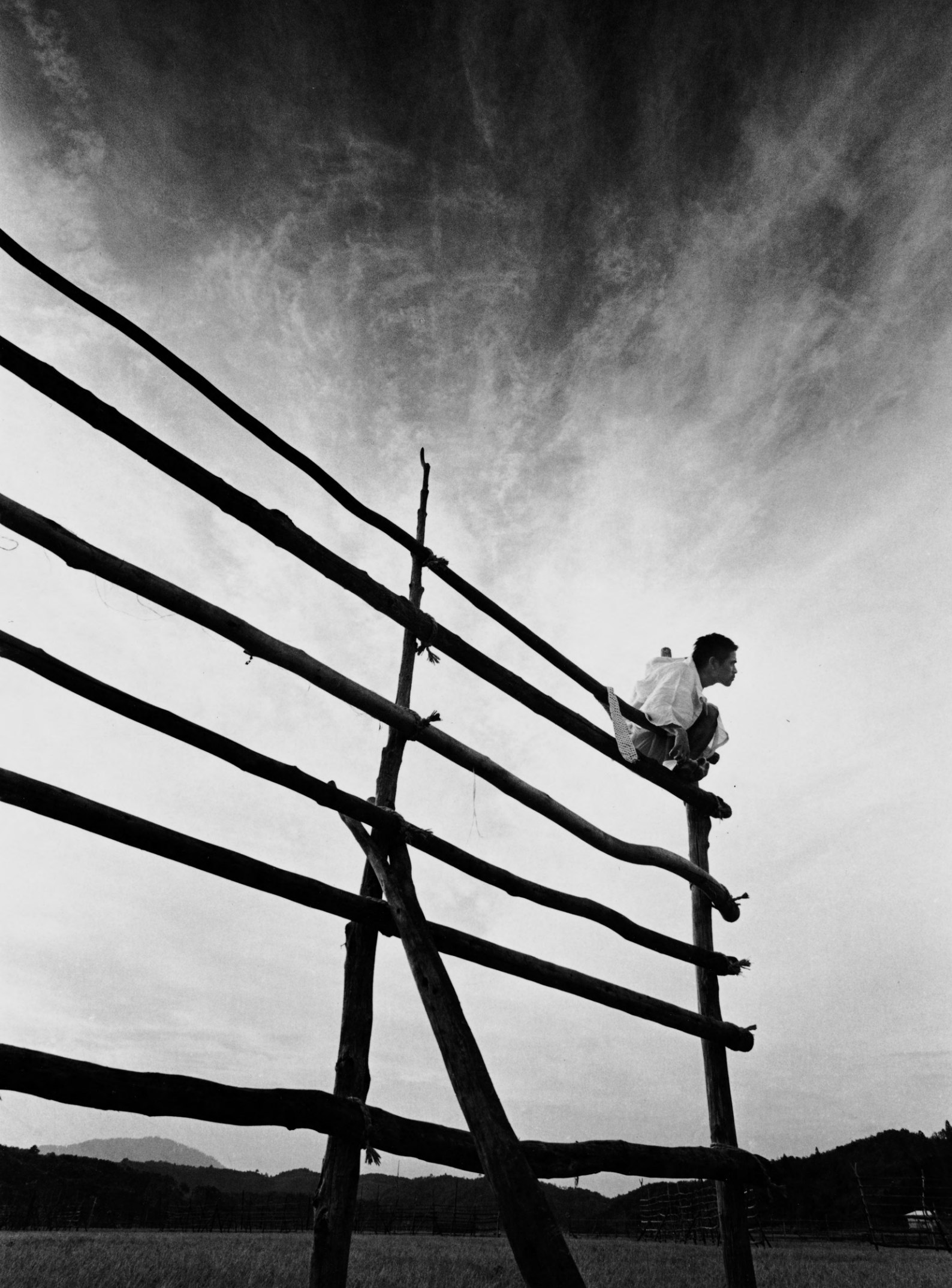
EIKOH HOSOE Kamaitichi #8, 1965