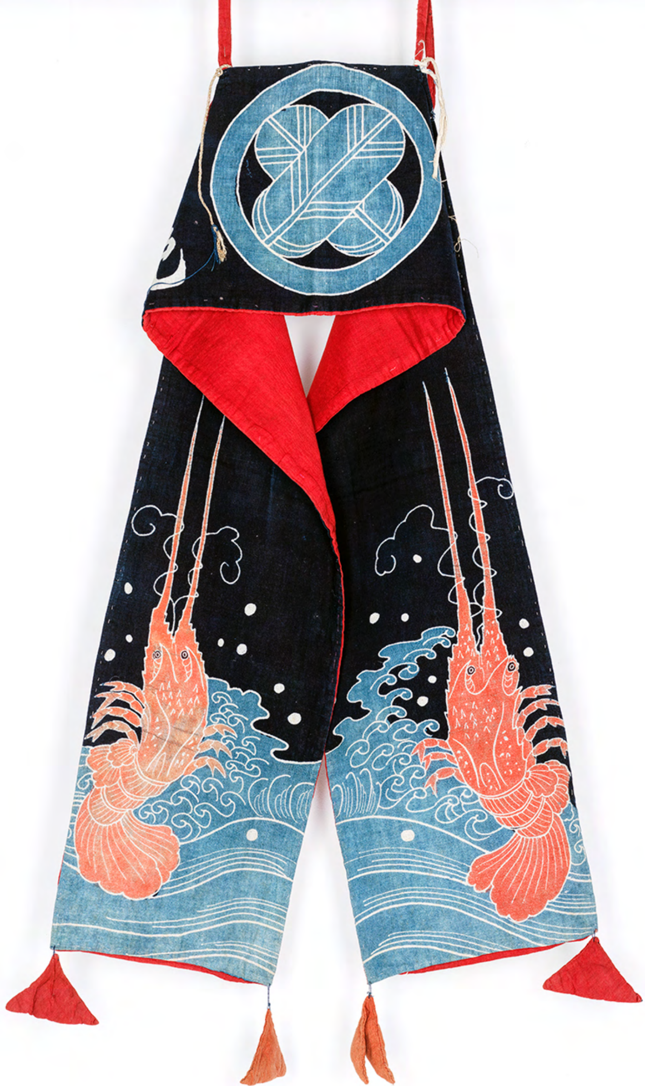
KIMONO, Indigo horse trapping with resist design of prawns, C19th