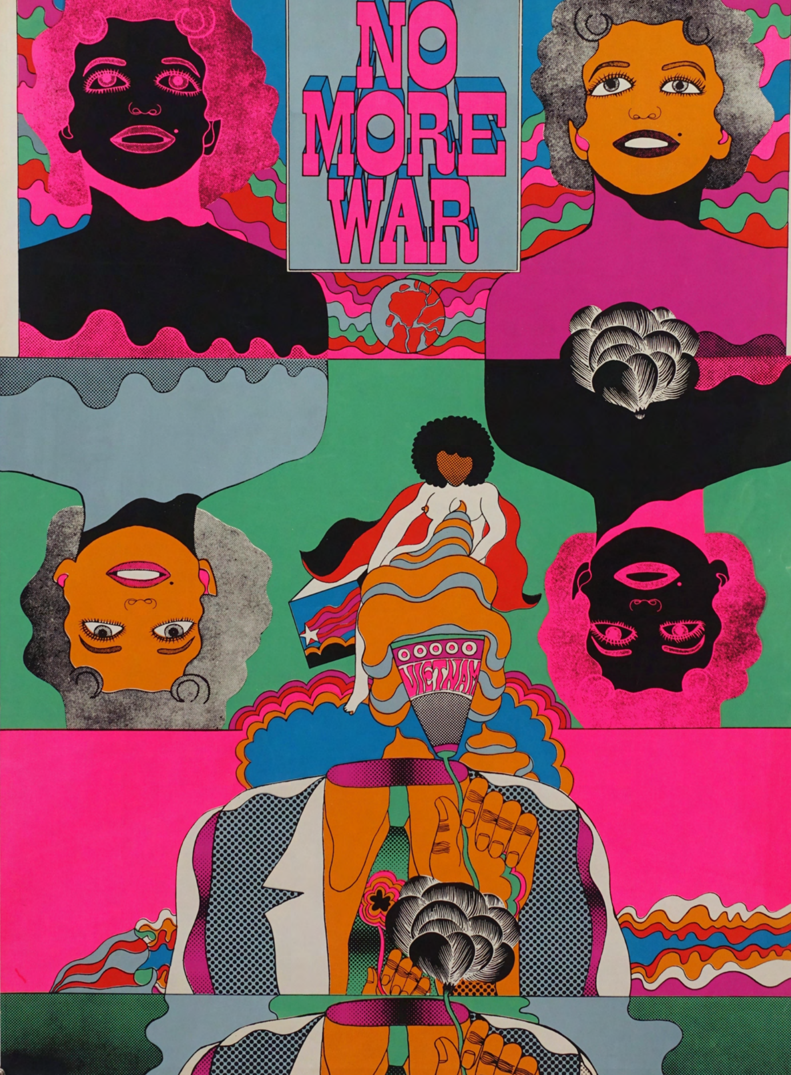
KEIICHI TANAAMI No More War, 1967