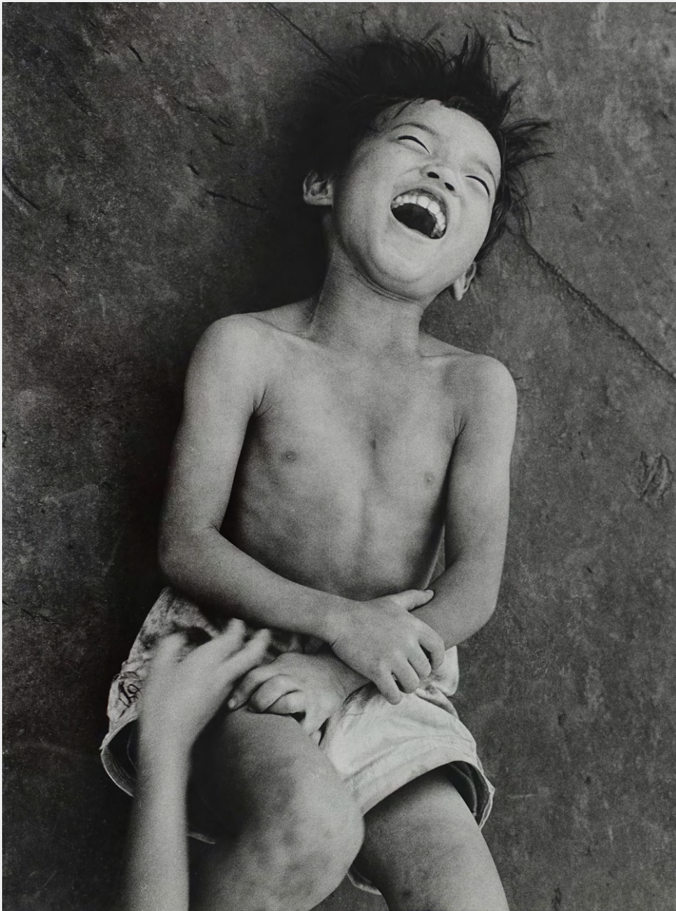
NOBUYOSHI ARAKI Sachin, 1963