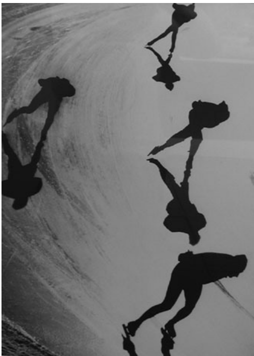
Skating silhouettes