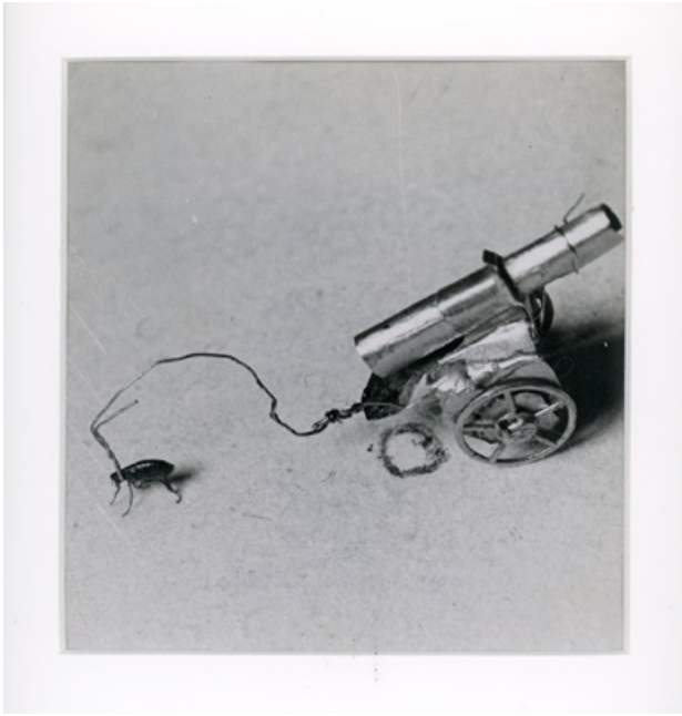
Robert Doisneau, Flea Circus with Gun carriage