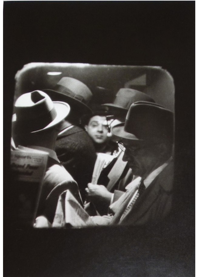
Louis Stettner, Commuters