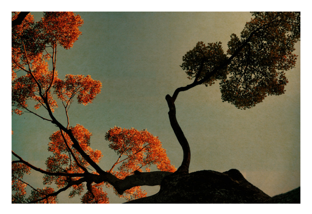
The Mouth of Krishna, #503, 2019. Pigments, Japanese paper and gold leaf, 17 x 26 cm.

The works in our display have been created using their proprietary technique, in which pigment prints are created on hand-made gampi paper and embellished with gold leaf to echo the luminosity and lustre of traditional Japanese silk painting. Each work carries a subtly unique patina, which heightens their interest and individual appeal in a world where digital printing has become so ubiquitous.