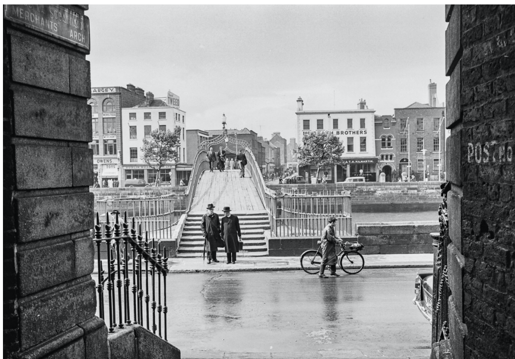
Bridge, Dublin 1963. Vintage silver gelatin print, 22.1 x 26.6