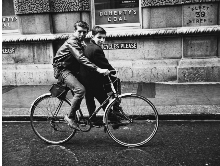
Two Boys on a Bicycle, Dublin 1963. Vintage silver gelatin print, 21.9 x 26.2 cm

Online exhibition dates: 15 th Jun – 15 th July, 2021