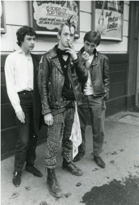
PETER PRICE Teenagers, Punk, 1970s 17.5 x 25.3 cm Original press stamp and credits on verso € 1,500