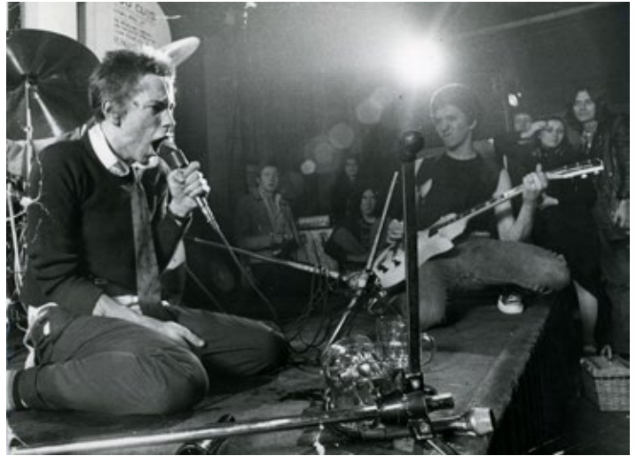
RAY STEVENSON Sex Pistols, 1970s 34.3 x 22.1 cm Original press stamp and credits on verso € 3,000