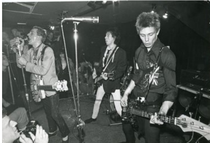
RAY STEVENSON Clash, 1970s 20.6 x 30.6 cm Original press stamp and credits on verso € 2,500