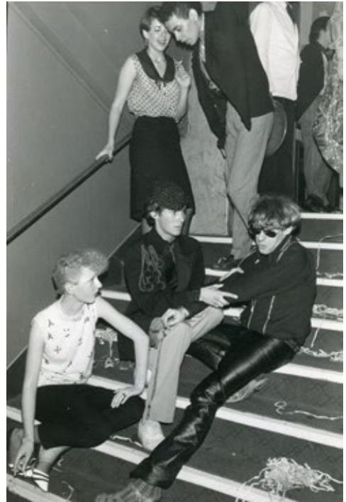
SIPA PRESS Teenage Punk Rockers, 1970s 20.2 x 30.2 cm Original press stamp and credits on verso € 2,000