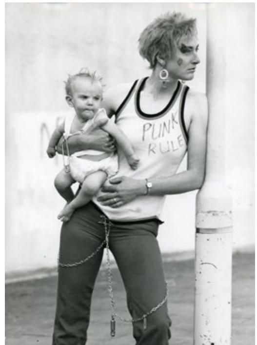
Punks, 1980s 23.8 x 30.5 cm Original press stamp and credits on verso € 1,500