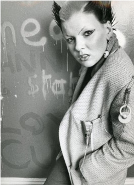
RAY STEVENSON Soo Catwoman, 1970s 26.6 x 37.7 cm Original press stamp and credits on verso € 2,500