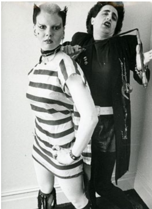
RAY STEVENSON Soo Catwoman, 1970s 26.8 x 36.5 cm Original press stamp and credits on verso € 2,500