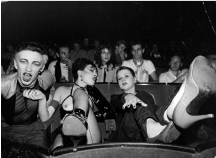
RAY STEVENSON Steve Havoc, Siouxsie Sioux, 'Debbie' 30.5 x 23.8 cm Original press stamp and credits on verso € 2,500