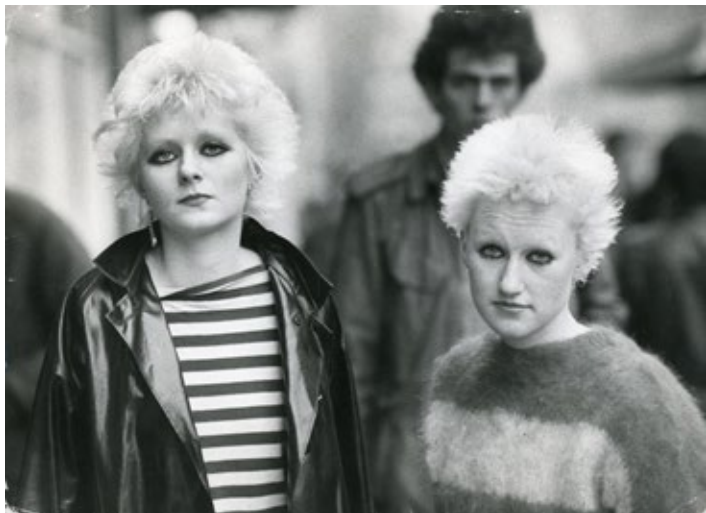
JONATHAN PLAYER Punk Rockers, King's Road, 1970s 30.3 x 22.3 cm Original press stamp and credits on verso € 1,500